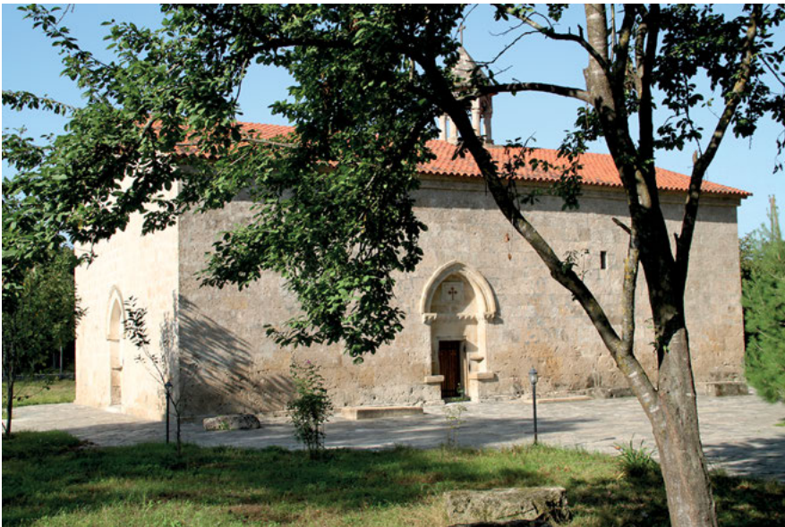
Fig. 3: The Chotari church after its reconstruction (August 2011).

of the deleted Armenian inscriptions). 48 “This is an act of vandalism and Norway in no way wants to be associated with it”, lamented Norway’s Ambassador to Azerbaijan Steinar Gil. Alf Henry Rasmussen, the director of the NHE in Azerbai-