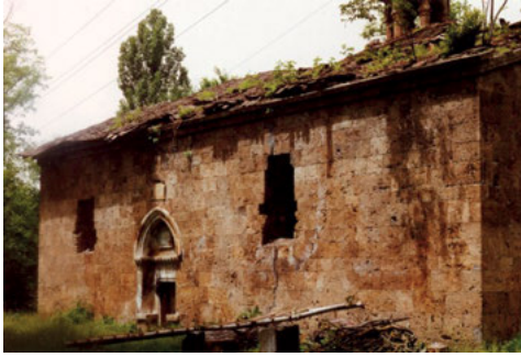
Fig. 1: The Chotari church before its reconstruction (1979).

Albanian language were discovered by scholars at St Catherine’s monastery in Sinai. It has been proven to be related to the Udi language. 46 The Udis are considered to be the closest descendants of the Albanians. As such, the small Udi minority community in Azerbaijan has been enlisted by the government to recreate the Albanian Church – as an important political asset in the process of rejecting and erasing Armenian presence in these territories.