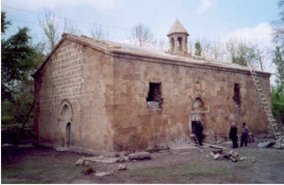
Fig. 2: The Chotari church during its reconstruction (May 2004).