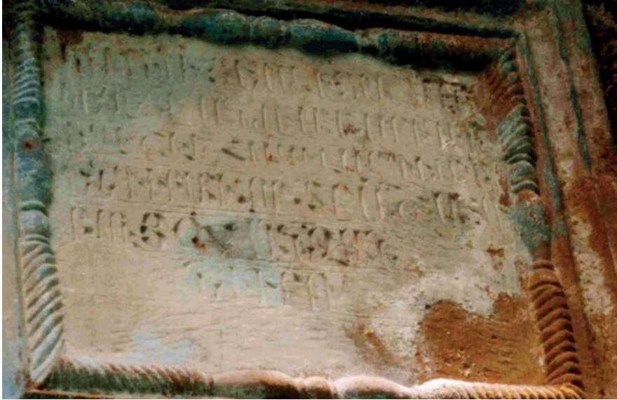
Fig. 4: Armenian inscription of the Chotari church (2004), now annihilated.

jan, said, “Luckily enough there are good pictures of all these writings. They are well documented. And it is my hope that when years have passed and the tensions between the two countries [Armenia and Azerbaijan] have eased, it will be possible to reinstall the original writings”. 49 A visit to the church by Norway’s prime minister was cancelled and no one from the Norwegian embassy attended the opening.