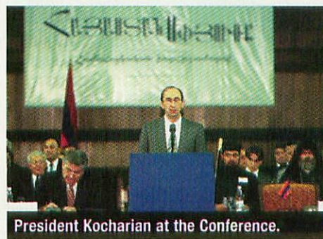
President Kocharian at the Conference.

The third most important thing was that Diasporans who participated in the Conference came to realize that the government is serious about developing, fine-tuning and institutionalizing an ongoing process of Armenia-