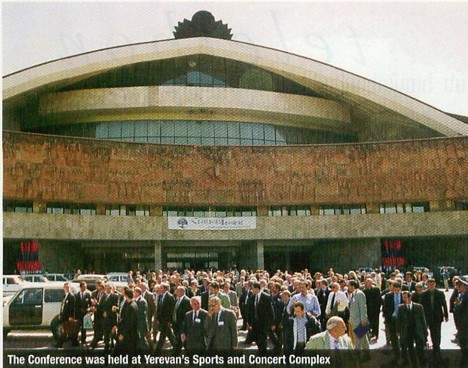
The Conference was held at Yerevan's Sports and Concert Complex

huge expense was borne by various donors from around the world.