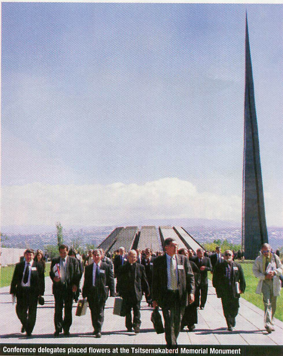
Conference delegates placed flowers at the Tsitsernakaberd Memorial Monument